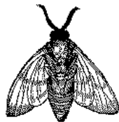
Figure 2: A sample black and white graphic that has been resized with the includegraphics command.

will convert .eps to .pdf for you on the fly. More details on each of these is found in the Author's Guide .